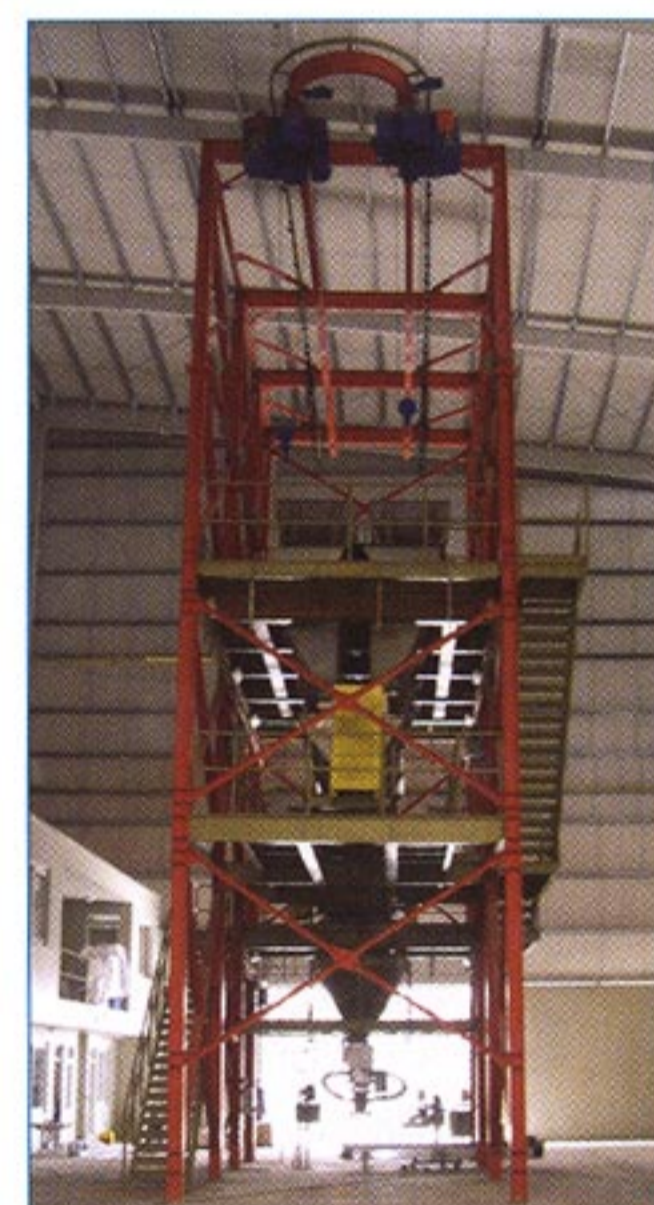
At the heart of the factory, the blending equipment for soluble NPKs

SQM and Yara marketing networks to sell its production in export markets. It is also anticipated that in view of the current size of the domestic market, more than 50% of the production will have to be exported if the factory is to run at full capacity. The current upgrading of Antalya port facilities will certainly help increasing the competitiveness of the factory. During the opening ceremony, Ali Özman, the MD of the company, underlined that quality is the most important criterion during the production process, therefore justifying the presence of a laboratory called Docto-Lab included in the new facilities. The Lab has now started to also run all kinds of soil, foliar and water analysis.