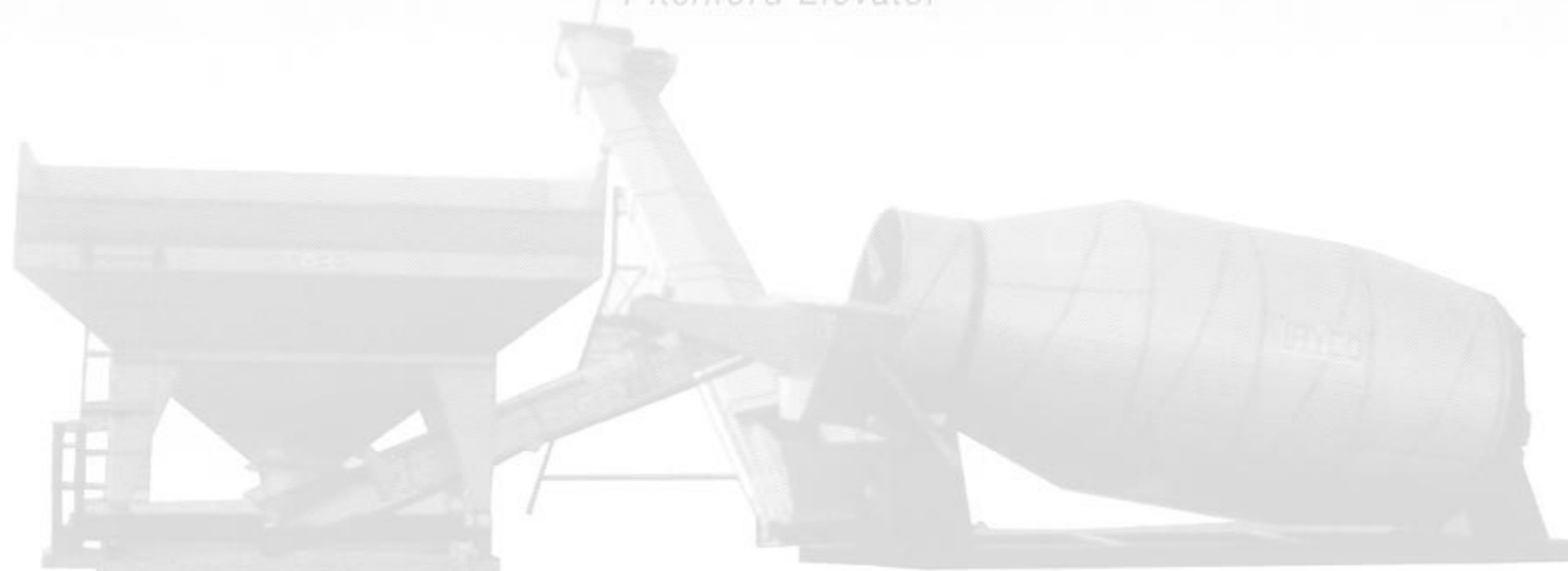
The Innovative Layco Rotary Blend System