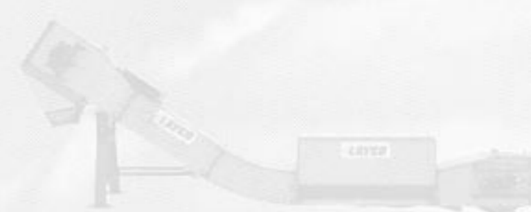
Chain Paddle Conveyors