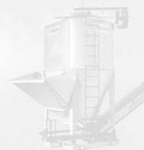
Tapered Vertical Blend Systems