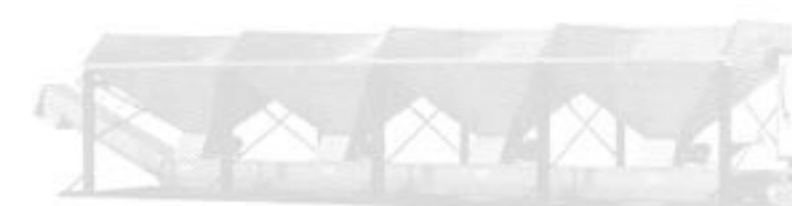
Volumetric Blend Systems